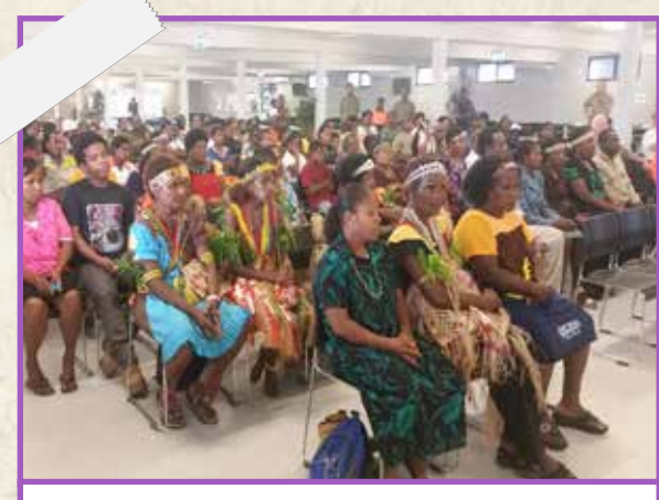
45 Manus man na meri i graduat wantaim setifikat tu na tri long kuk. Trenin i soim ol sumatin long fud sekyuriti, wei bilong kukim kaikai na wok seifti. Dispela setifikat bai givim planti Manus gutpela sans long kisim wok long turisim na hospitaliti bisnis.