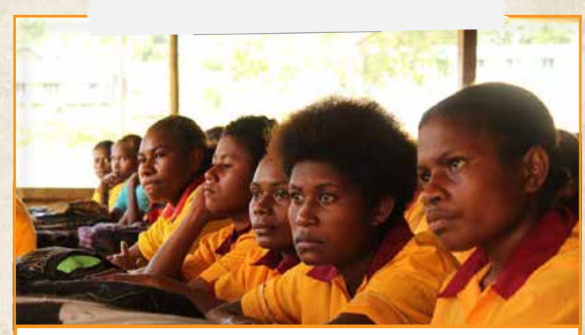
ECOM hai skul sumatin i harim ol toktok bilong Australia Award Scholarship wok man na meri long 2015. Australia i givim bikpela halivim long edukasen sekta bilong Manus long niupela 20 klasrum na skolaship long ol Manus man na meri long kisim lainim long bikpela skul long PNG na Australia.