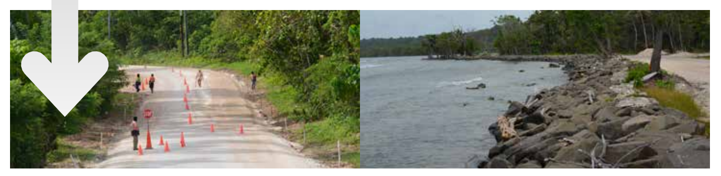
Base layer preparation for Momote-Lorengau road

Finalise seal on Momote-Lorengau road Install road signs and paint white lines Final inspection Demobilisation